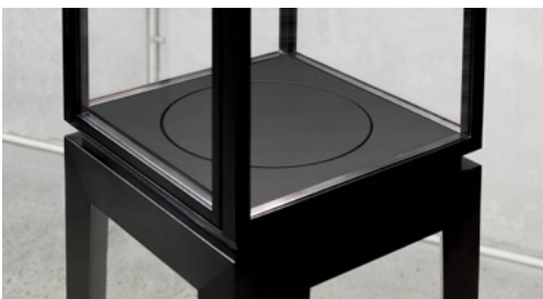
Rotating Display Base (Optional)