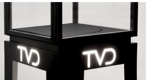
Personalised Backlit Logo - Available for Showcase Sale (Optional)